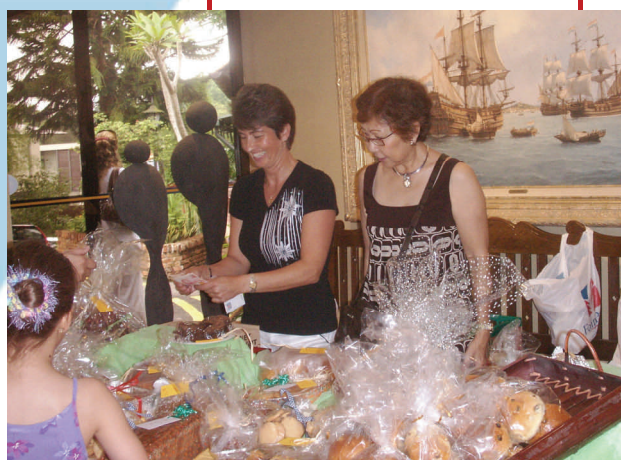
Krentenbollensale at the Mayfair