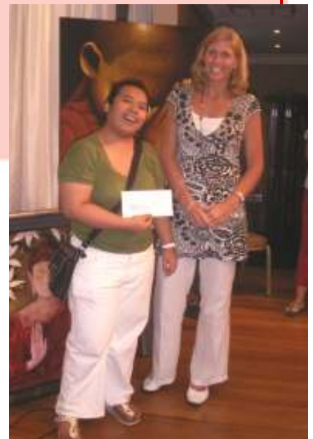
The lucky winner of the main prize, two KLM sponsored tickets to the Netherlands

Naturally, we are extremely grateful to the many, many other sponsors!