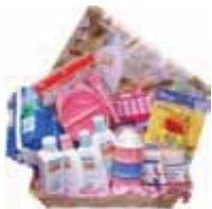
Baby shower (S$50)