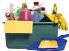
Cleaning Chemicals (S$15)