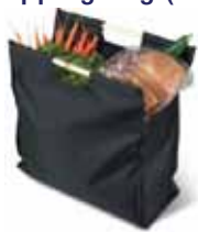
Shopping bag (S$60)