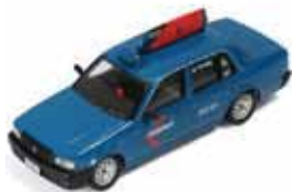
Transport Fee (S$10)