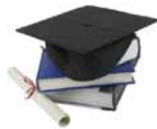
One month of education (S$175)