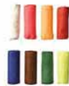
Play dough (S$20)